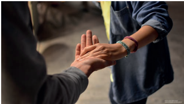
You can always seek a helping hand at the BTBF.

I joined the BT Benevolent Fund in March 2021 as the Office Administrator after a long career in BT, almost 40 years in fact! I joined BT in 1980 as a Subscriber Apparatus and Line Tester. The grade was known as a Technician 2A or T2A which I'm sure many of you will be familiar with. I completed my basic training in Shirehampton, Bristol and Stone along with many other engineers and also attended the local college to secure my BTEC certificate in microelectronics. All studying was funded by BT in those days for which I am eternally grateful! I was then promoted to a Technical Officer (TO) spending the majority of my time in the Bristol area repairing digital PABX systems, such as Monarchs and Merlins. Some years later I moved to BT Redcare as a TO(A). After rolling out the new Redcare secure alarm network with a small team of dedicated engineers, I was then responsible for its maintenance and management in Wales & the West